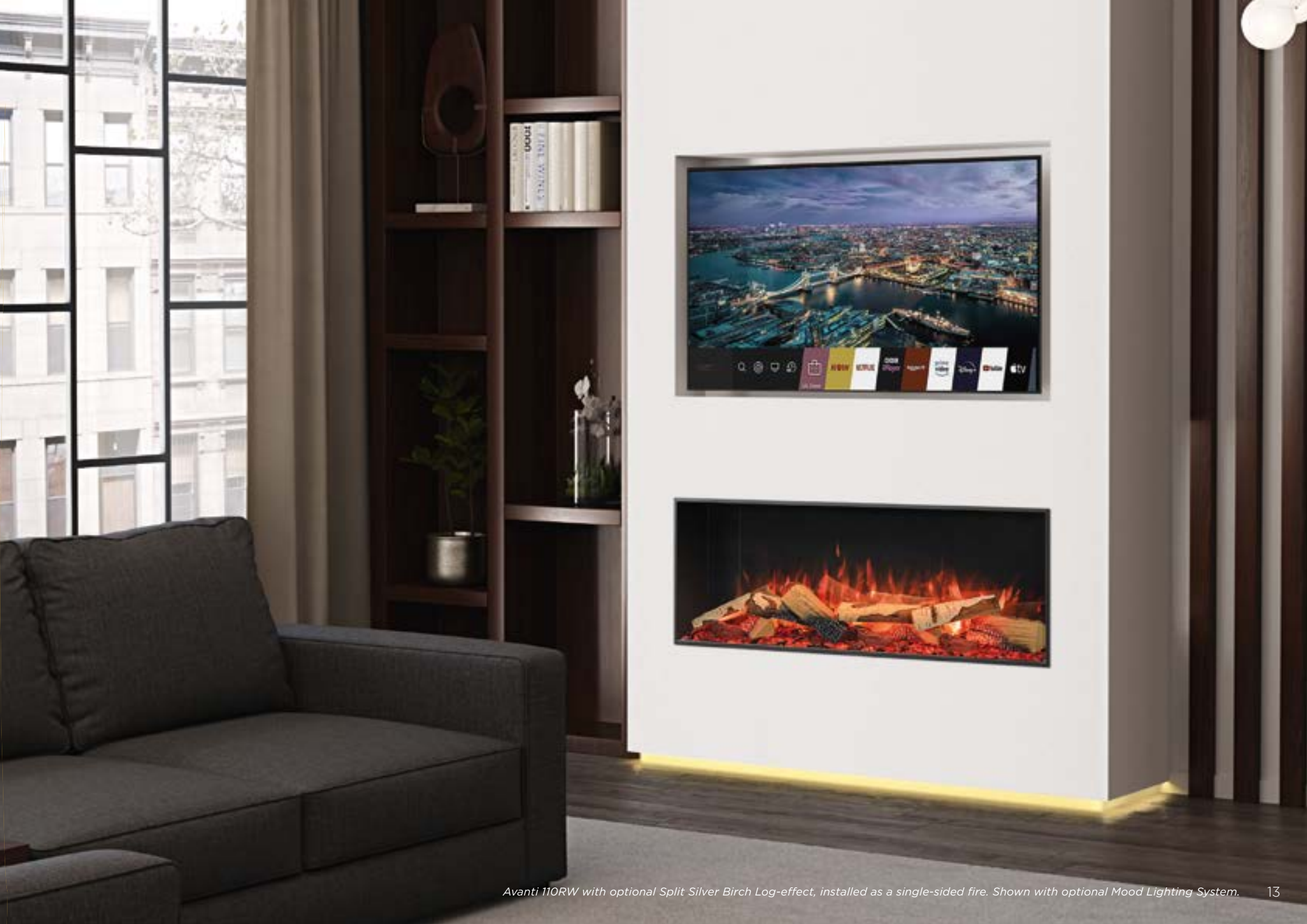
Avanti 110RW with optional Split Silver Birch Log-effect, installed as a single-sided fire. Shown with optional Mood Lighting System.