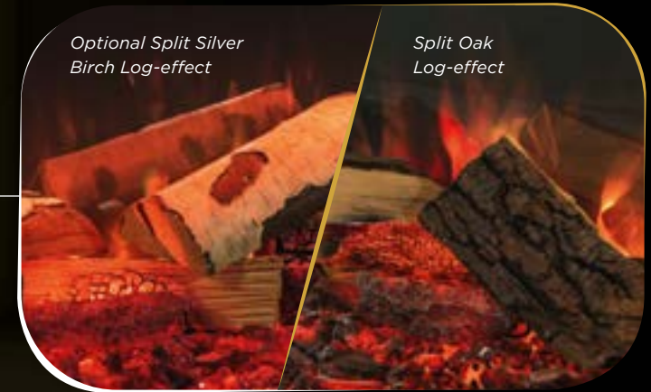
Split Oak Log-effect