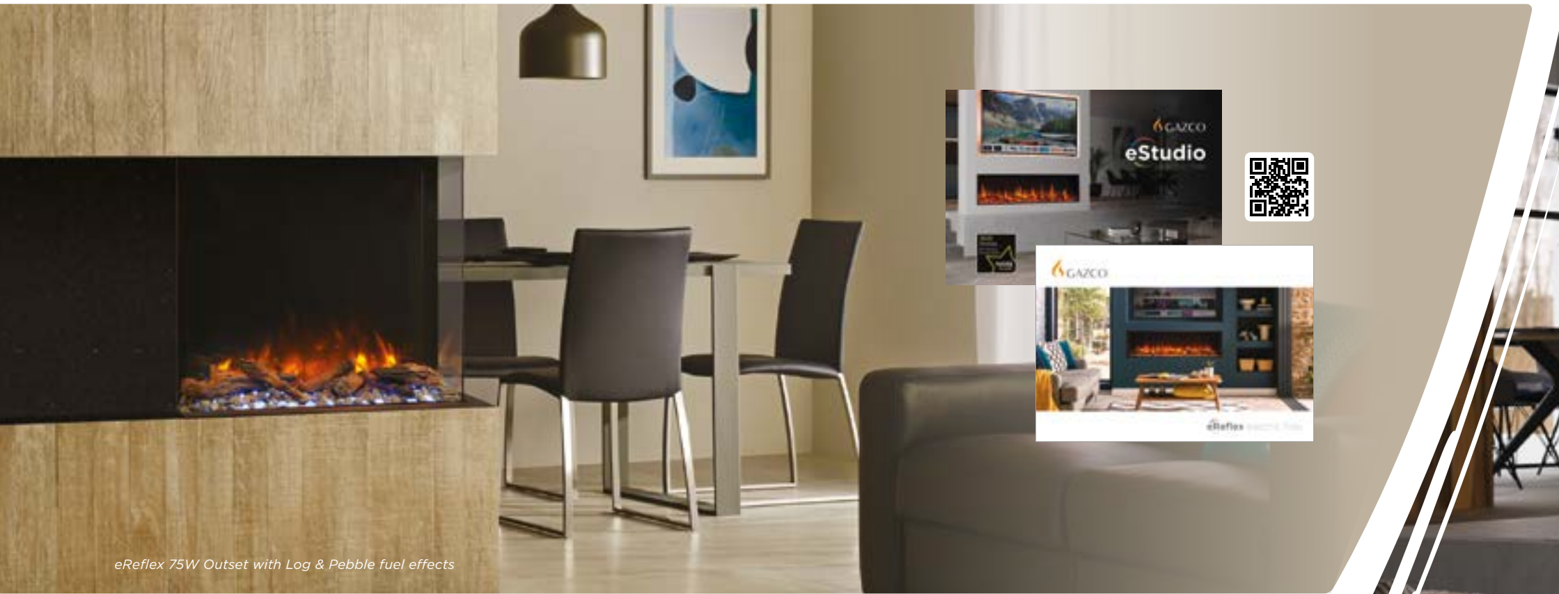
eReflex 75W Outset with Log & Pebble fuel effects

The Stovax Heating Group's electric fire collection also includes the Gazco eReflex and eStudio ranges.