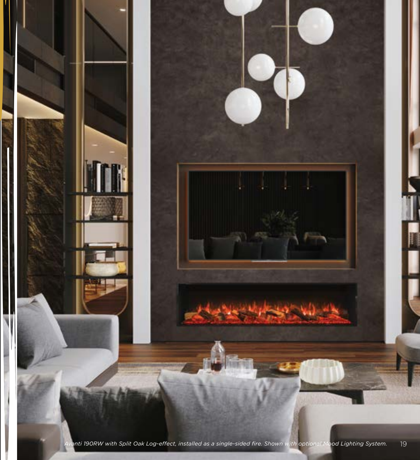
Avanti 190RW with Split Oak Log-effect, installed as a single-sided fire. Shown with optional Mood Lighting System.

See pages 3, 7, 11 & back cover for additional images