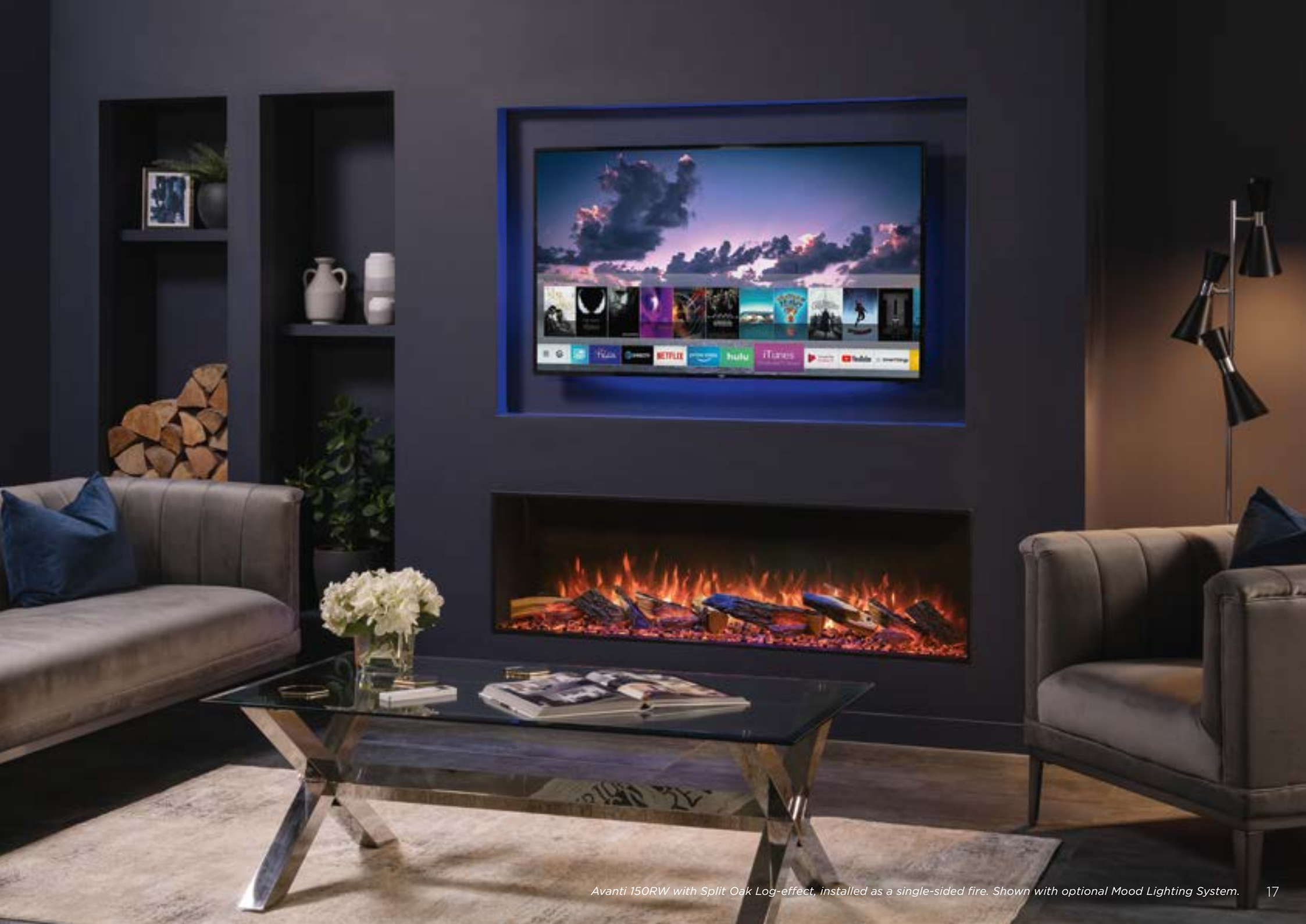
Avanti 150RW with Split Oak Log-effect, installed as a single-sided fire. Shown with optional Mood Lighting System.