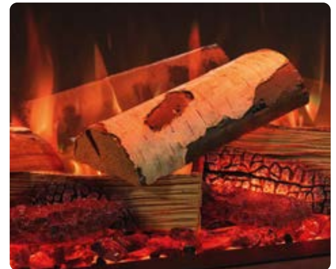
Optional Split Silver Birch Log-effect