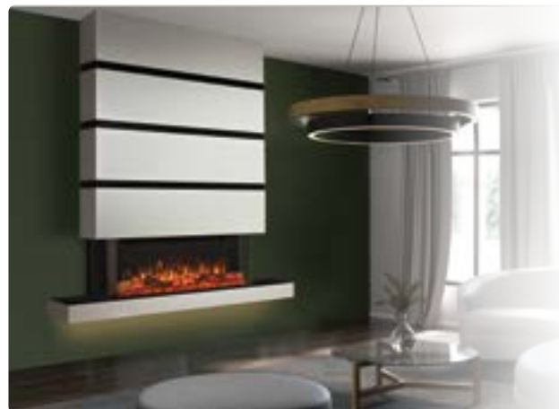
Avanti 110RW with Split Oak Log-effect, installed with Milazzo Suite floating shelf and four top sections in white.