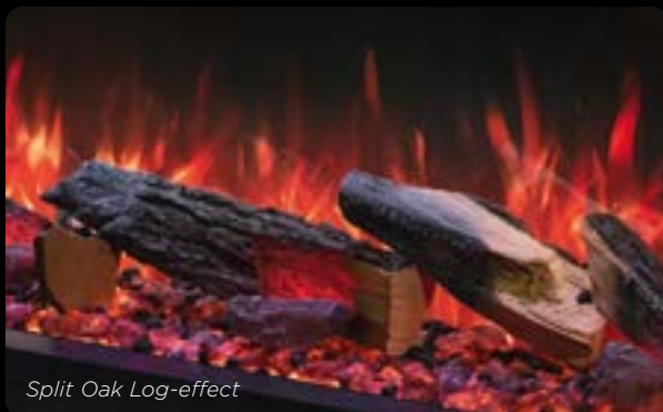
Split Oak Log-effect

See pages 3, 7, 11 & back cover for additional images