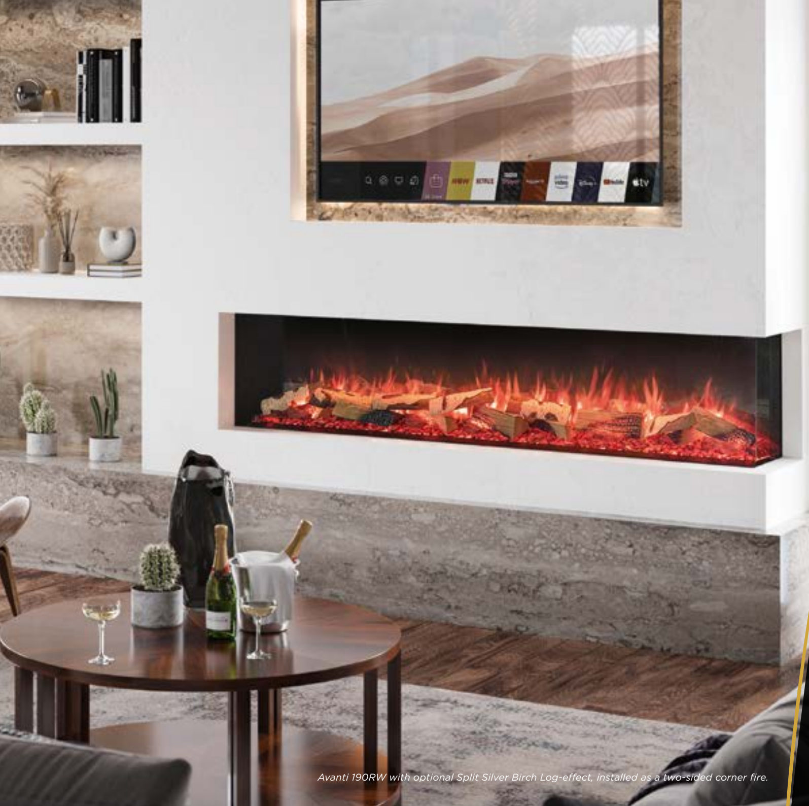
Avanti 190RW with optional Split Silver Birch Log-effect, installed as a two-sided corner fire.