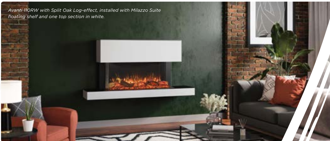
Avanti 110RW with Split Oak Log-effect, installed with Milazzo Suite floating shelf and one top section in white.

Fixing flat against a wall for a quick and easy installation, the Milazzo's modular design can be tailored to create a floating focal point or floor-to-ceiling centrepiece.