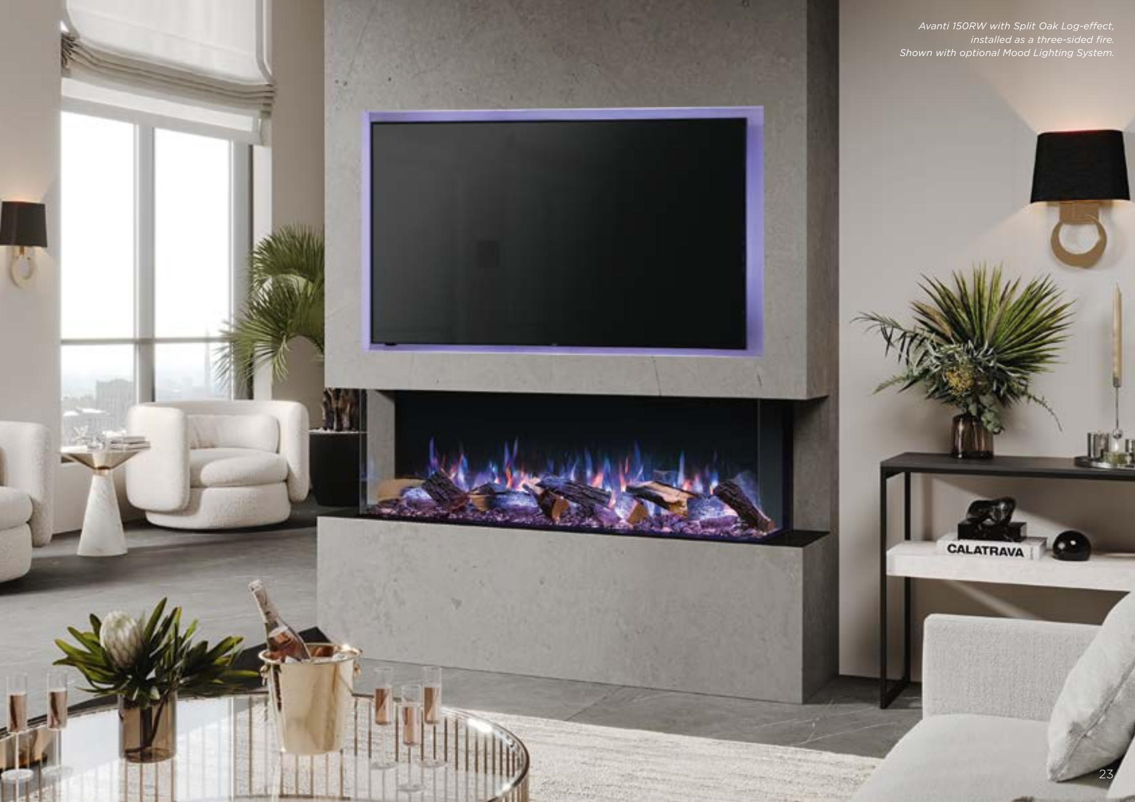
Avanti 150RW with Split Oak Log-effect, installed as a three-sided fire. Shown with optional Mood Lighting System.